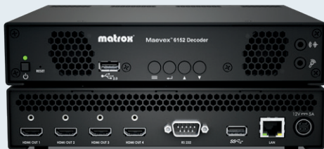
Matrox Maevox 6152 quad 4K decoder appliance (front & back view)