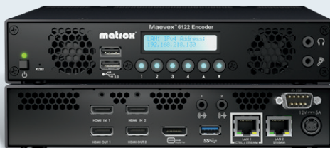
Matrox Maevox 6122 dual 4K encoder appliance (front & back view)