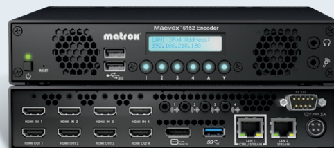
Matrox Maevox 6152 quad 4K encoder appliance (front & back view)