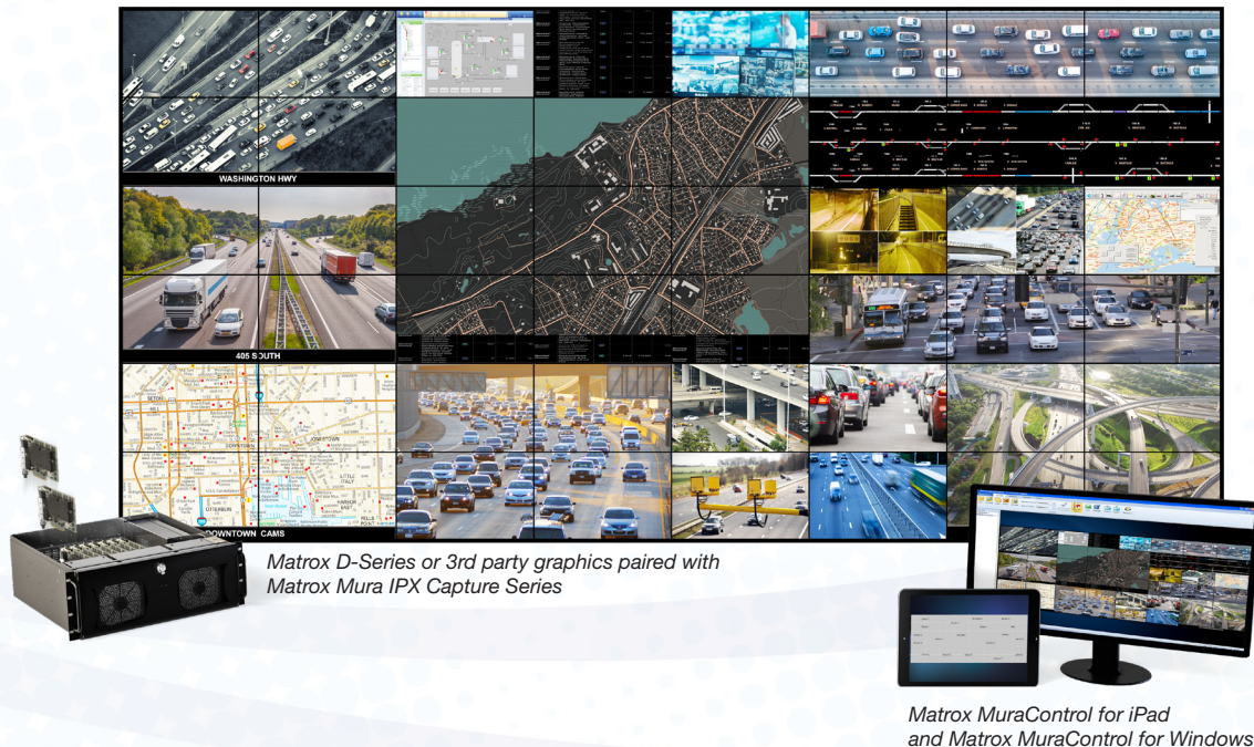
Matrox D-Series or 3rd party graphics paired with Matrox Mura IPX Capture Series