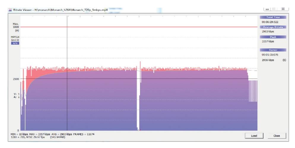
Figure 3. Bitrate Viewer showing a 3 Mbps file flat lined at 3 mbps.