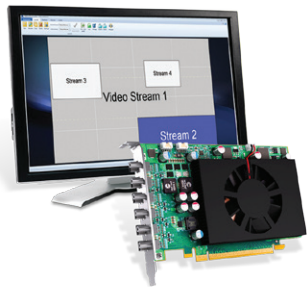
Matrox C680 graphics card with Matrox MuraControl Software

"The video wall looked flawless, which added great ambiance to a wonderful and memorable evening—exactly what we were looking for!"