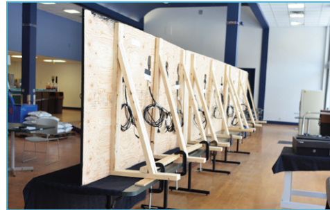
Custom-built paneling designed by Matrox's in-house team to support the video wall installation.

each end. A graphic designer created four video files, two light patterns mirroring each other for the 10 middle displays, and two dancing figures placed on the two larger screens. MuraControl then gave operators added layout flexibility to manage the digital signage content and how it would appear on the video wall. The media files, when launched simultaneously, would play as complementary and seamless content.