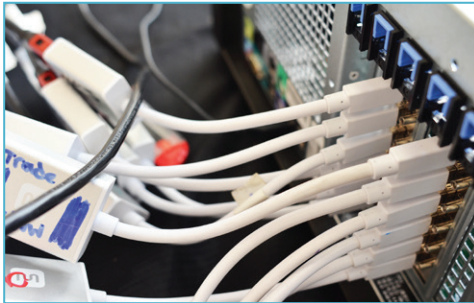
Each C680 graphic card provides six mini DisplayPort output connections.