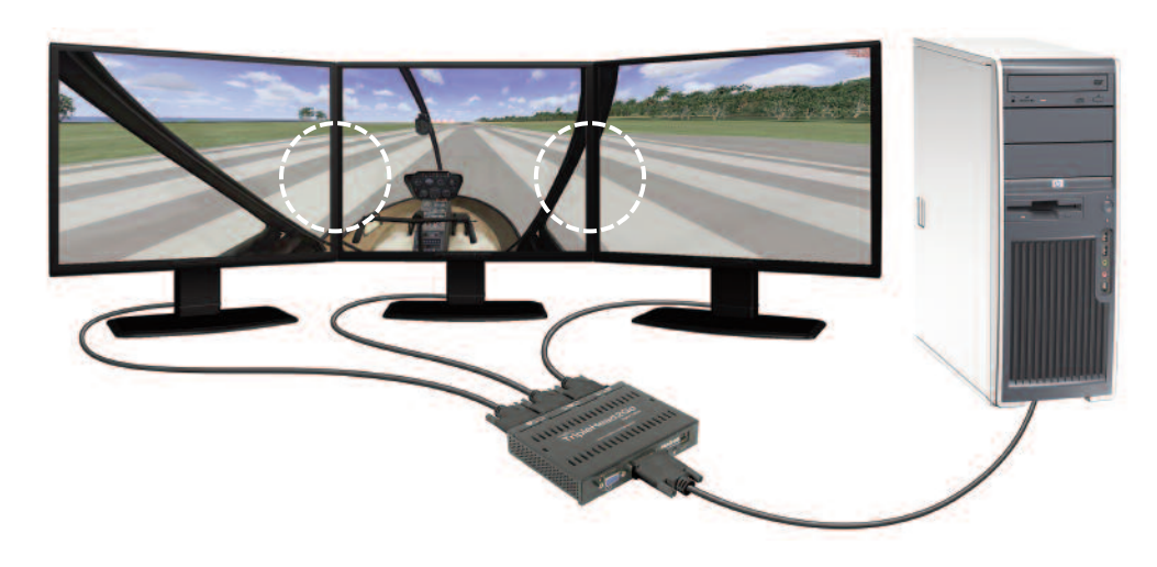
Flight Simulator X with Monitor Bezel Management:

Flight Simulator X without Monitor Bezel Management: