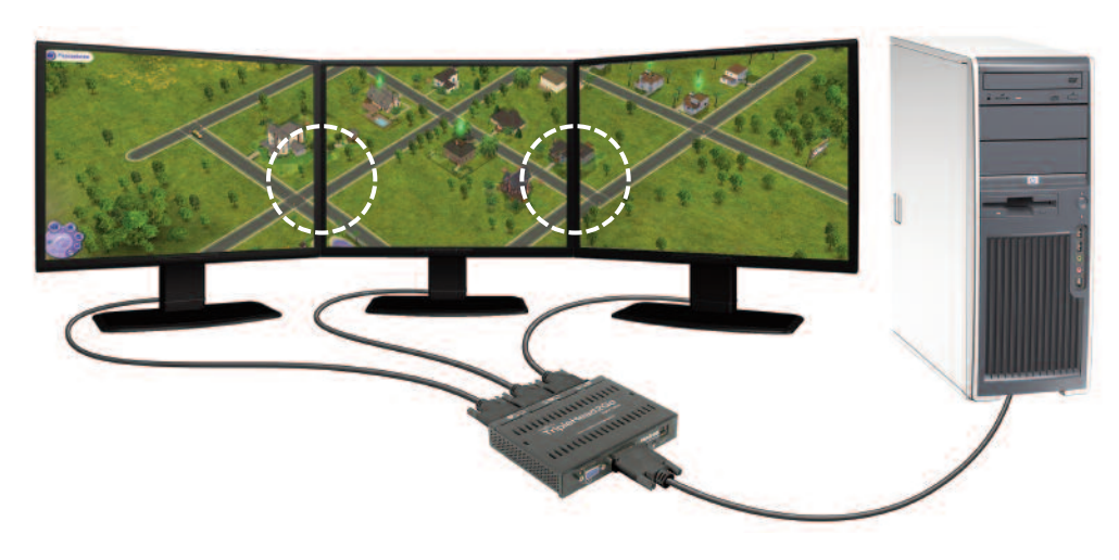
The Sims 2 with Monitor Bezel Management:

The Sims 2 without Monitor Bezel Management: