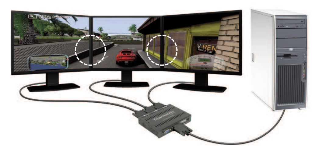
Test Drive Unlimited with Monitor Bezel Management:

Test Drive Unlimited without Monitor Bezel Management: