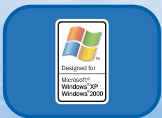
Unified drivers and features