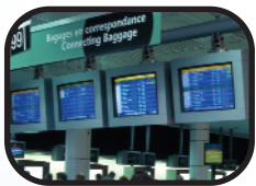
Flight information displays (Matrox Multi TV Out)