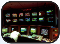
Process control systems