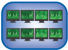
Multiple analog or digital support

With more than 25 years of industry experience, Matrox is an established technology leader of business solutions and dominates over 70% of the premium financial multi-monitor market. The Matrox G450 X2 and X4 Multi-Monitor Series (MMS), with the smallest four-chip graphics accelerator, represents the newest addition to the MMS line of products. The Matrox G450 X2 and X4 MMS offer outstanding multi-monitor support and unparalleled image quality to the financial, medical and industrial markets.