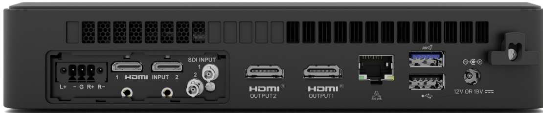
Matrox Vion EX (back view)

Input baseband, IPMX, NDI, and SRT, and cross-convert streams concurrently with simultaneous output. Increase productivity and throughput by processing multiple inputs at the same time. Mix and match output formats and protocols to deliver the right content the right way.