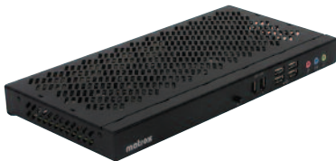
Matrox Remote Graphics Unit